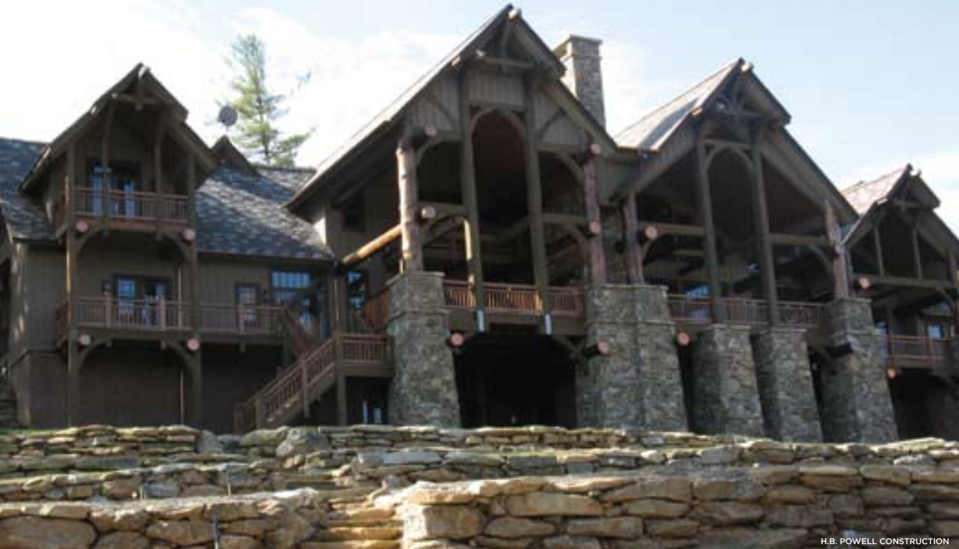
H.B. POWELL CONSTRUCTION